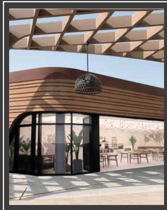
AL HIRAH BEACH SHARJAH