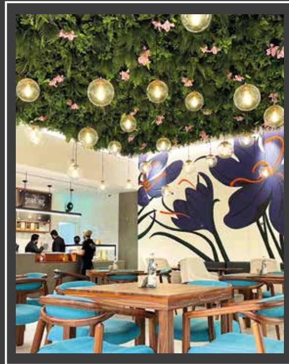
CITY CENTRE AL ZAHIA SHARJAH