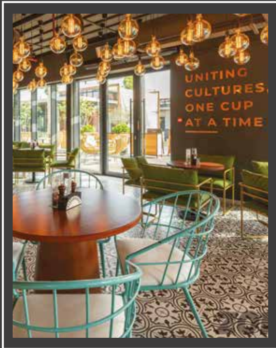
LA MER NORTH DUBAI